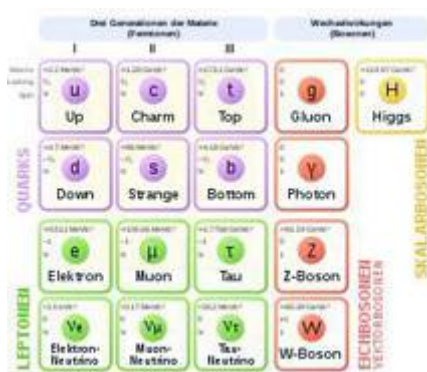
• Fig. J.2.E Elementary particles [en.Wikipedia.org].

elementary beings : spiritual beings entrusted with just one task each. They implement changes in *elements effecting what we call phenomena of natural laws. They may be released from their tasks after a human died if we had lived correspondingly affectionately.