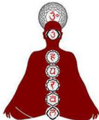
Fig. J.2.C Chacras [Wikipedia.de].

centripetal force : force contrary centrifugal force, e.g. gravitation force.