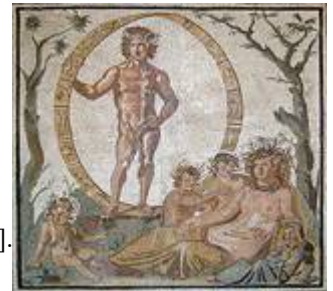
Fig. J.2.a God Aion. [Wikipedia.de].

eon : [from the ancient Greek : aión ] denotes individual 'life' or 'life time', then 'a very long span of time', an 'age', or 'eternity'. In a medical context aión denoted the spinal marrow as the seat of the life force. [Wikipedia.de]. - In Fig. J.2.a god Aion is represented in the zodiac with the four seasons as well as Tellus (in Latin : "earth", in Roman mythology the goddess of motherly earth, so often named Terra Mater, too, corresponding to Gaia.) [Wikipedia.de].